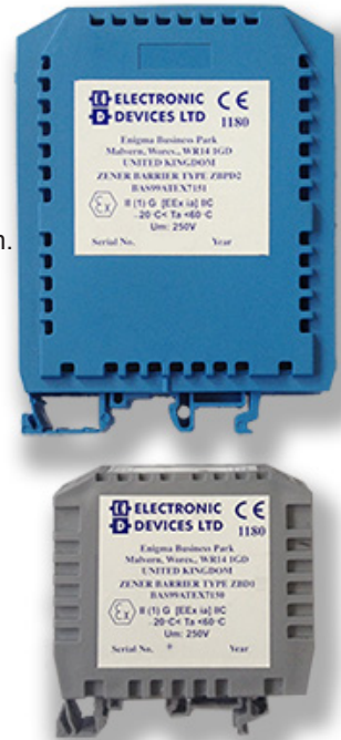
Type ZBD din rail mounting Zener Barrier with external dimensions of 63 x 63 x 13mm.