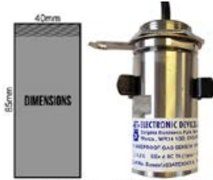
Type EDF 1B, 2B or 3B (Stainless Steel) II 2 G EExd IIC T6 Weight: 0.5 Kg M32 male threadplanes.

The EDF is intended to be Bulkhead mounted in quick release clips to facilitate testing calibration etc. The EDF types are suitable for direct internal tank mounting using the M32 male thread or via suitable adaptors to conduit, junction boxes etc.